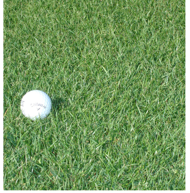
BREAKOUT with STT is ideal for golf applications. It's fine leaf texture and density match that of warm season bases much better than other turfgrass varieties. These traits combined with smooth, predictable transition allow for use on tees and fairways.

BREAKOUT with STT (right) exhibits a much darker green color and also a much finer blade